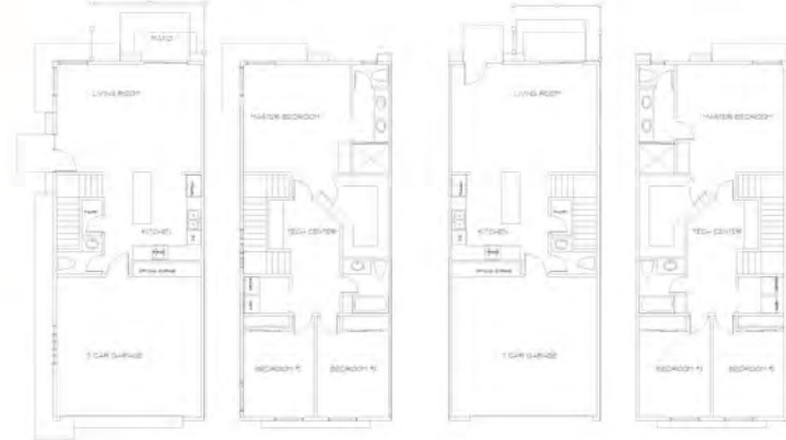
PLAN 1633-SIDE FLOOR PLAN 3-BEDROOM/LOFT 1633 SF. UPPER LEVEL FLOOR PLAN PLAN 1633-END FLOOR PLAN UPPER LEVEL TOWNHOME MODELS FLOOR PLANS