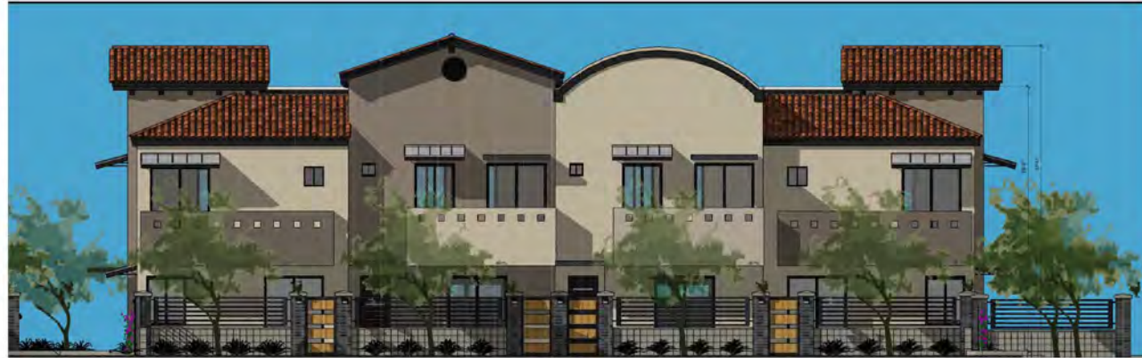
FRONT ENTRY ELEVATION