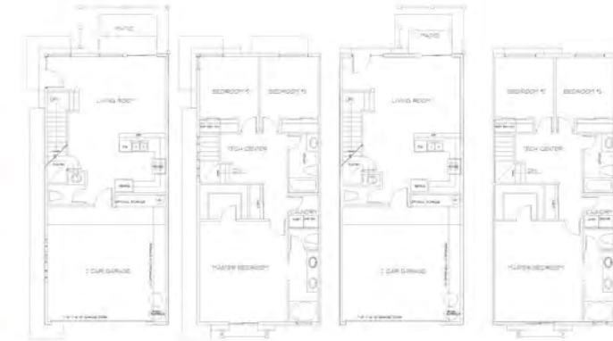
PLAN 1503-SIDE FLOOR PLAN 3-BEDROOM/LOFT 1503 SF. UPPER LEVEL FLOOR PLAN PLAN 1503-END FLOOR PLAN UPPER LEVEL