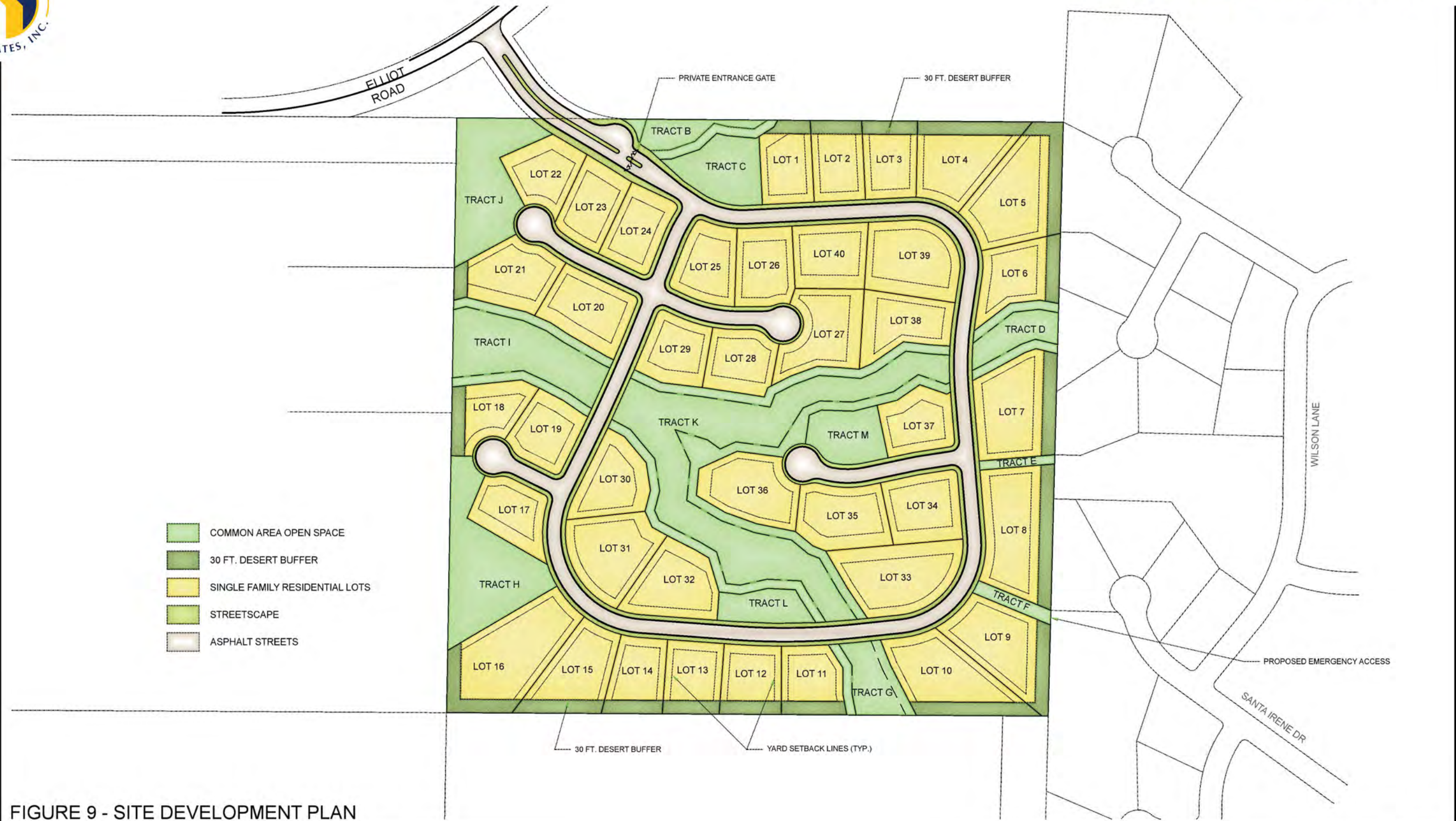
FIGURE 9 - SITE DEVELOPMENT PLAN